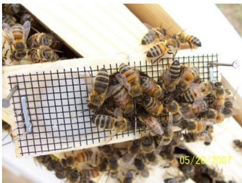
Queen in a cage

The package of bees usually contains bees shaken from two or more colonies, and the queen supplied with the package is bred from selected colonies to be sent in the package. The queen is kept in a separate small wooden or plastic cage with one screened side and candy release plug. The caged queen in the package is well protected and fed through the screen during transportation, and usually accepted by the bees within 12 – 24 hours. The bees free the queen to leave the cage by eating the sugar candy blocking the exit hole of the cage.