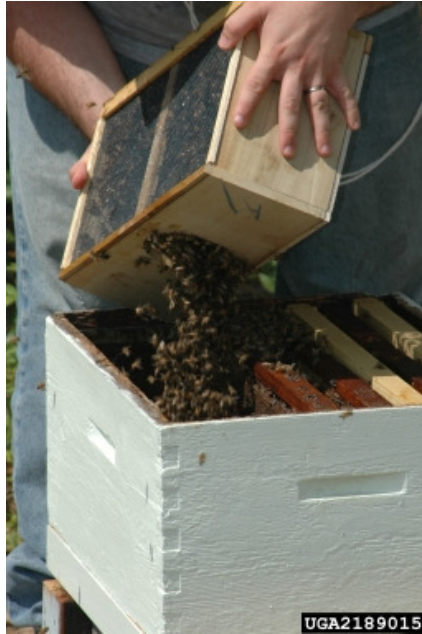
The bees are shaken into the hive