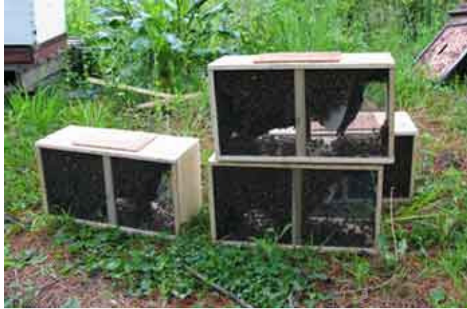
Packages of bees ready for hiving

Khalil Hamdan, Apeldoorn, the Netherlands