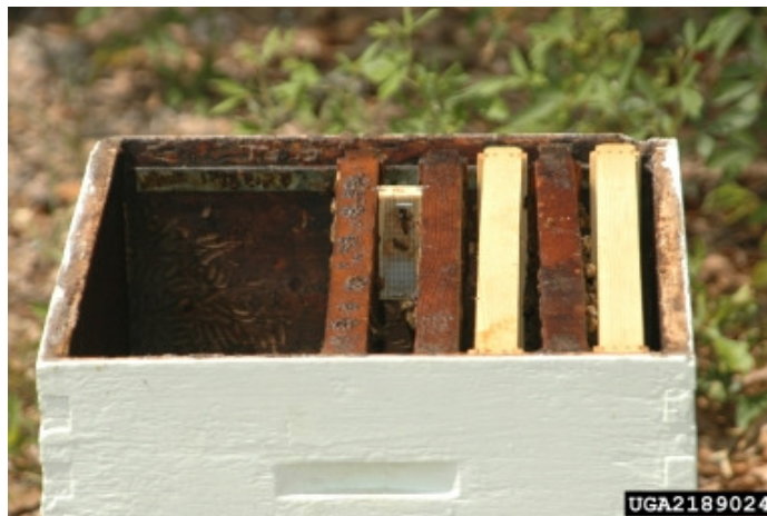
Queen cage between two frames