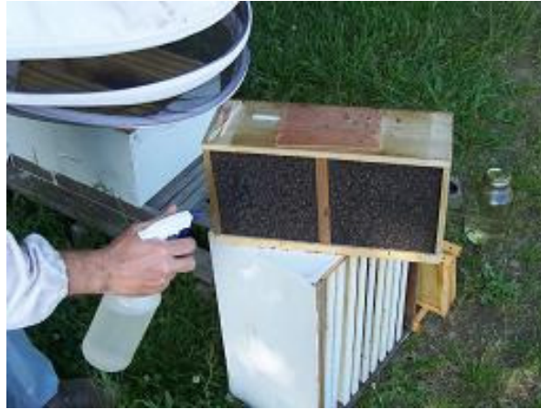
Spraying a package of bees with sugar syrup