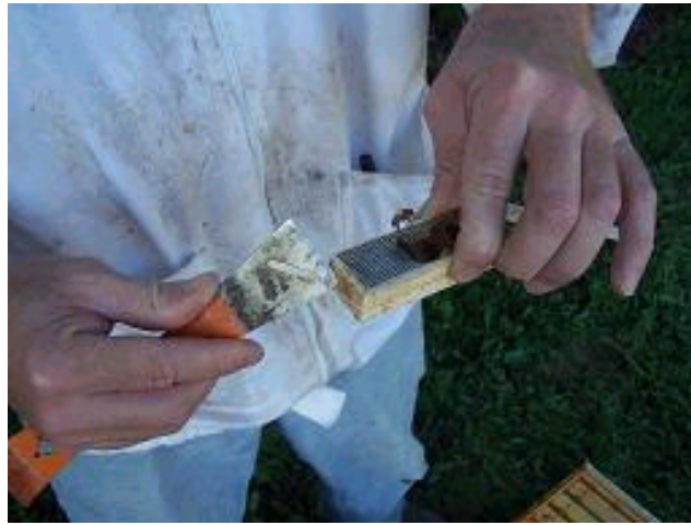
Removing the cork covering the candy plug