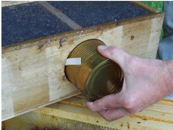
Removal of can feeder